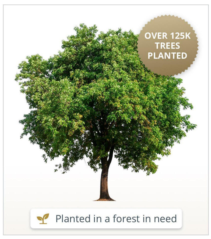
Cluster of 20 Memorial Trees